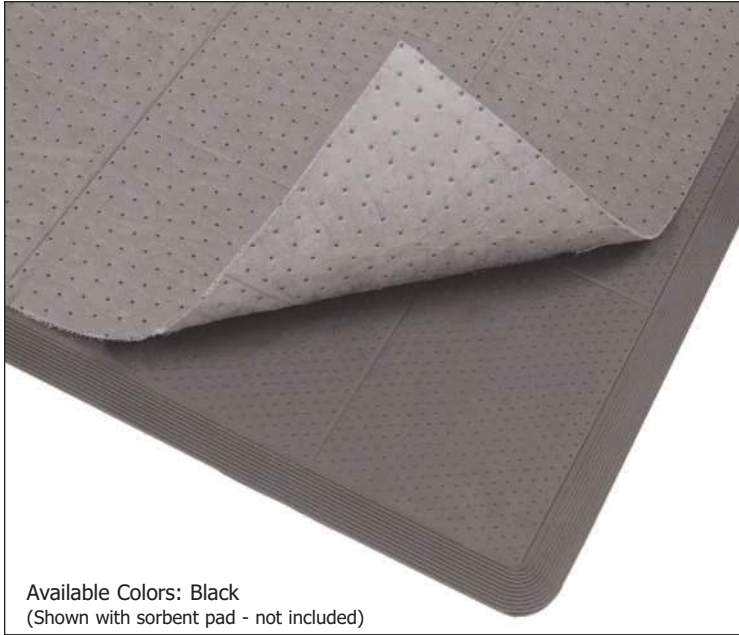
Available Colors: Black (Shown with sorbent pad - not included)