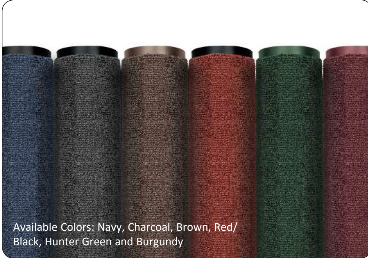
Available Colors: Navy, Charcoal, Brown, Red/Black, Hunter Green and Burgundy